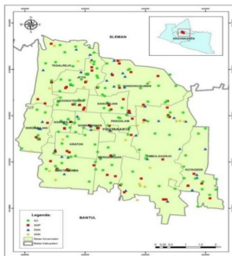
Figure 1. Map of school location distribution in Yogyakarta City

emission factors refers to EMEP / EEA Corinair Small Combustion, while CO 2 still uses emission factor provided by the IPCC Guidelines (see Table 1).